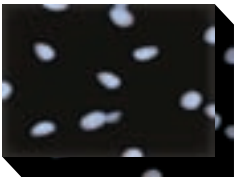
Black Paisley* PL-280

(Columbia PolyLife® is a Solid Plastic HDPE material)