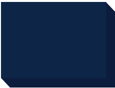
Deep Blue* PL-300