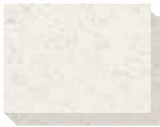
Sand Speckle* PL-120